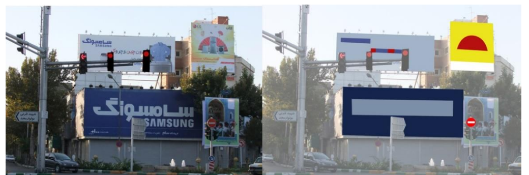
Figure 3. Sanabad five-road intersection, Color Composition