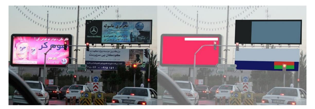
Figure 4. Khayam Junction, Color Composition